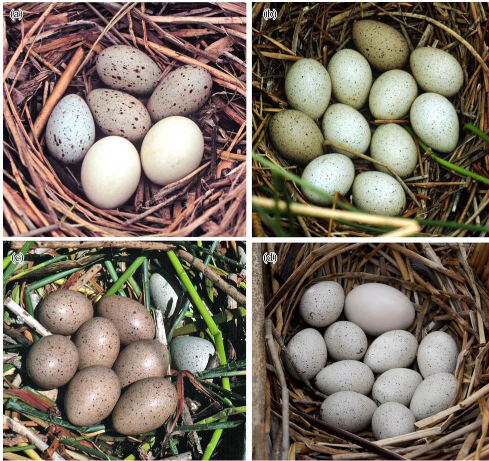
Figure 2. Natural and experimental brood-parasitic eggs. (a) Two real black-headed duck eggs (white) in a red-gartered coot nest in Argentina. (b) American coot nest with nine host eggs and two conspecific brood-parasitic eggs (darker eggs) in British Columbia. (c) American coot nest with seven host eggs and two paler conspecific brood-parasitic eggs in the process of being buried in the edge of the nest. (d) American coot nest with an experimental brown duck egg.

three treatments and compare overall rejection rates. This comparison serves the same function as the comparison of the white duck treatment but the much larger sample size increases the statistical power of the test.