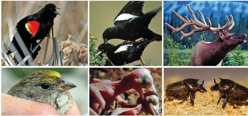
Figure 3. The types of ornaments and weapons produced by sexual selection (top row) are also produced by non-sexual social selection (bottom row). The red epaulettes of red-winged blackbirds ( Agelaius phoeniceus , top left) are used in territorial defence during the breeding season [32], resulting in enhanced mating success; the colourful crowns of golden-crowned sparrows ( Zonotrichia atricapilla , bottom left) help win contests over food in winter [33], and winter social dominance correlates with enhanced survival in other bird species. Bird beaks are used as weapons by many birds to defend territories that serve to attract mates, including lark buntings ( Calamospiza melanocorys , top centre) [34]; beaks are also used as weapons by offspring in species such as laughing kookaburras ( Dacelo novaeguineae , bottom centre), wherein siblicide increases food resources for the aggressor, resulting in improved survival [35]. Horns and antlers are favoured by sexual selection in male insects and mammals such as elk ( Cervus canadensis , top right), where they function as weapons used in fights over females [36]; female beetles ( Onthophagus sagittarius ) use their horns to fight over resources their offspring require [37] (bottom right).

congruence between sexual and non-sexual forms of social selection with respect to these characteristics further supports the notion that they together comprise a distinct form of natural selection, as West-Eberhard and others [5] initially proposed. More generally, some attributes of sexual selection that are thought to make it unique with respect to non-sexual forms of natural selection are actually properties shared with social selection.