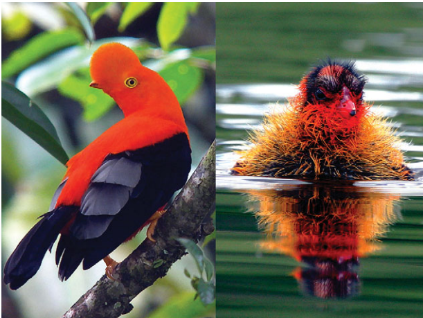
Figure 1. Similar ornamental traits are favoured by both mate choice (left, male Andean cock-of-the-rock) and parental choice (right, newly hatched American coot chick), showing how similar traits can be favoured by sexual (left) and non-sexual (right) forms of social selection.

selected. Social interactions involving ornamental traits and weapons that occur outside the context of mating and fertilizations suggest that sexual selection is sometimes too narrow a window through which to view the evolution of such traits.