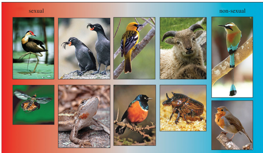
Figure 3. Female traits mediate competition in different social contexts that span a continuum from pure Darwinian sexual selection over matings (left, red) to pure non-sexual social competition over ecological resources like food and winter territories (right, blue), as well as natural selection in the form of predator-avoidance. This continuum runs from ornaments on the left to weapons (and anti-predator signals) on the right, though many traits have multiple functions at different points along the continuum. Clockwise from upper left: Irediparra gallinacea , Aethia cristatella , Icterus pustulatus , Ovis aries , Eumomota superciliosa , Erithacus rubecula , Onthophagus sagittarius , Lamprotornis superbus , Sceloporus virgatus and Rhamphomyia longicuada . See table 1 for fitness contexts for all species, except Irediparra gallinacea [211], where females compete for males, and Lamprotornis superbus [68], where females may compete for mates, reproductive opportunities or territories. Placement of some species along the sexual–non-sexual continuum is speculative because the fitness components underlying competition are poorly known. See acknowledgements for photo credits.

It is also clear that mechanisms underlying ornamental traits should not be assumed to relate exclusively to reproduction. For example, studies of female ornaments in dark-eyed juncos ( Junco hyemalis ) assume that the main route to fitness is increased reproductive success [27], but the same signals are also known to mediate dominance interactions over food during the non-breeding season [216]. Similarly, patterns of variation in male eyestalks of diopsid flies are generally thought to be driven entirely by sexual selection [217], even though provisioning experiments show that they also increase access to food [201]. Even in Drosophila melanogaster , one of the most intensively studied organisms, behavioural traits long assumed to be sexual displays actually relate to aggressive defence of food [218]. It seems likely that the predominance of the sexual selection paradigm has resulted in an overemphasis on the role of sexual interactions in the study of such ornamental traits, particularly in females.