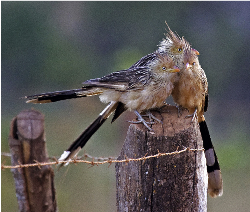
Figure 1. Cuddly but competitive.

The four members of the subfamily Crotophaginae, including the guira cuckoo ( Guira guira ) shown here, are all communal breeders where several females lay eggs in the same nest and then cooperate to raise the offspring. However, competition is also rife and females toss each other's eggs to control the skew in maternity.